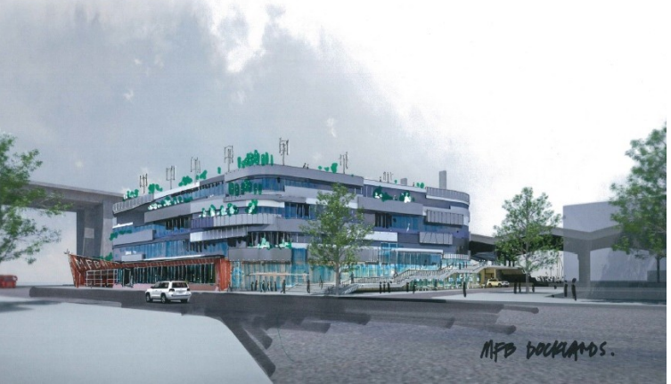
Above: Artist's impression of the proposal. Courtesy: MFB "Firecall"

Whilst the cost of this project is substantial and the MFB's forecasted budget has already been allocated, Property Services is working with Places Victoria on ways to fund and explore alternative options, never before undertaken by the MFB, that would be of low cost to the MFB to bring this facility to fruition to meet its operational service delivery requirements.