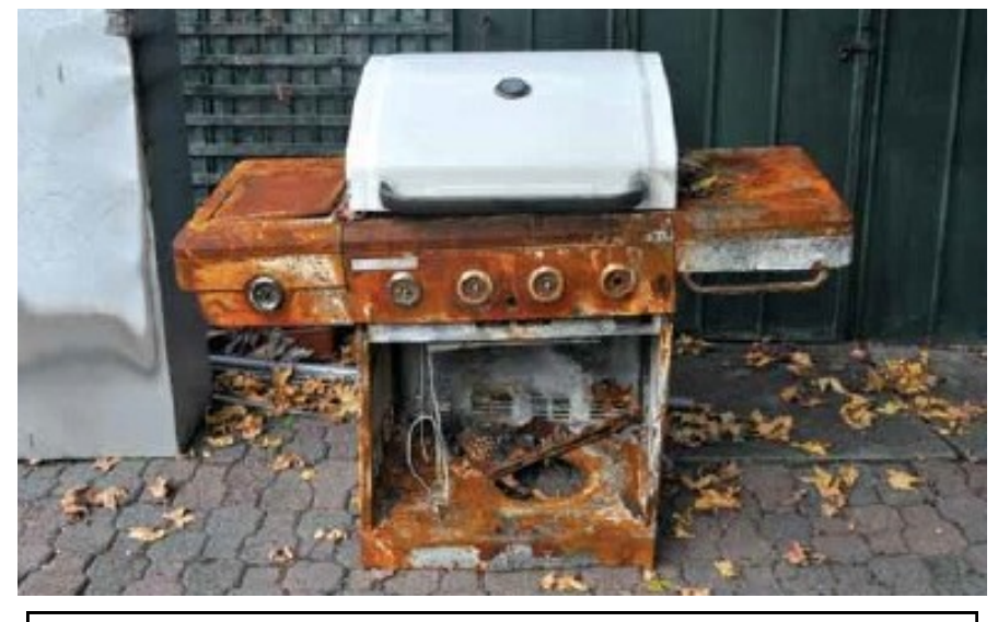
Above: Look before you cook. Don't let your barbecue end up looking like this. Take 5 minutes to read this advice.

Safe, refilled cylinders are available from most petrol stations. When you are transporting cylinders keep them upright in the boot of the car. Always store them