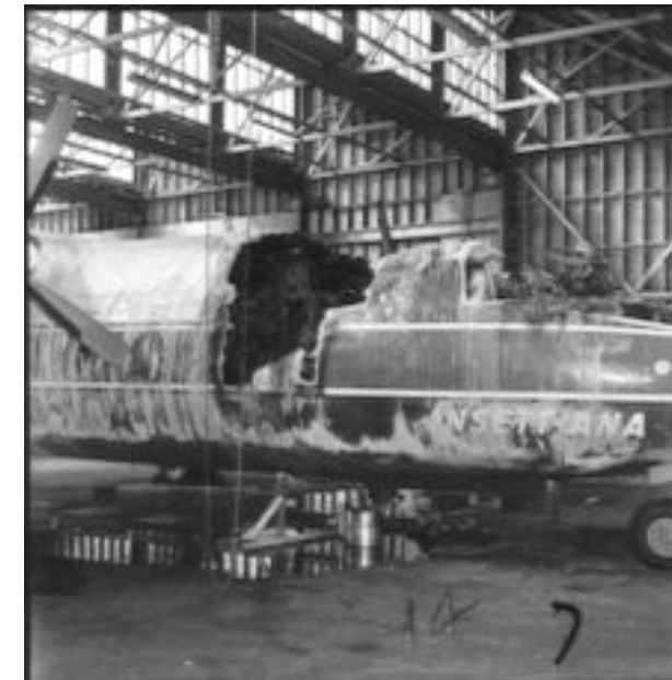
Above: The burnt-out shell of the aircraft sits in the hangar. A great piece of detective work using early profiling techniques led to the arrest of the arsonist.