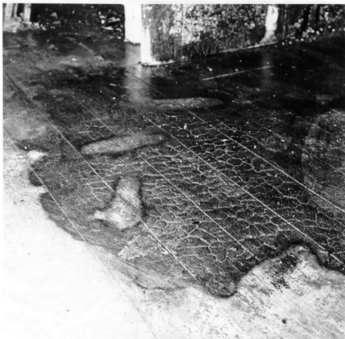
Above: These burn patterns were revealed after the debris was removed and the floor washed. This pointed to an arson attack and the early arrest of the offender. Unfortunately the company never recovered and closed down soon after.

* returned to the scene and indicated in photographs how and where he lit the fire