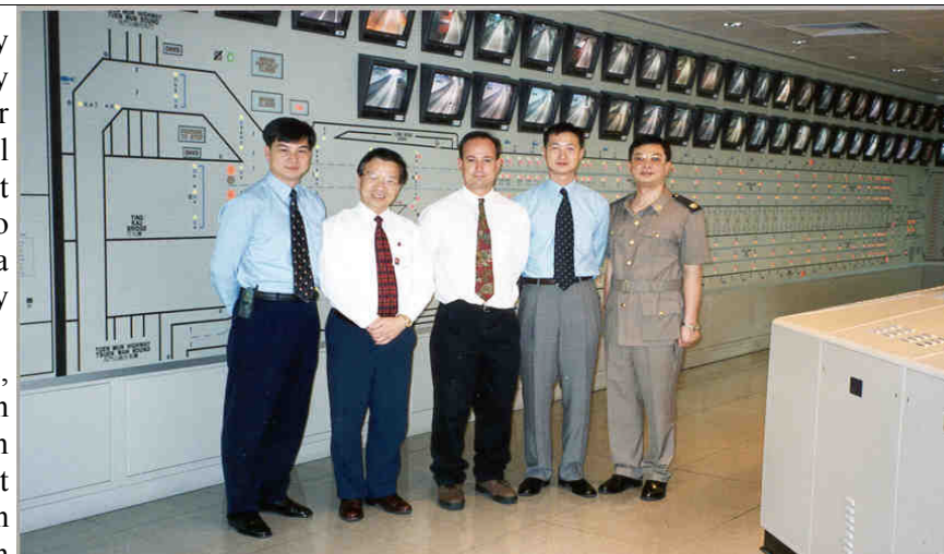
Myself (in the middle), with Hong Kong Fire Brigade personnel and operation management in the operations control room of the Tai-Lam Road Tunnel in New Territory, Hong Kong.

result of major incidents in overseas tunnels?