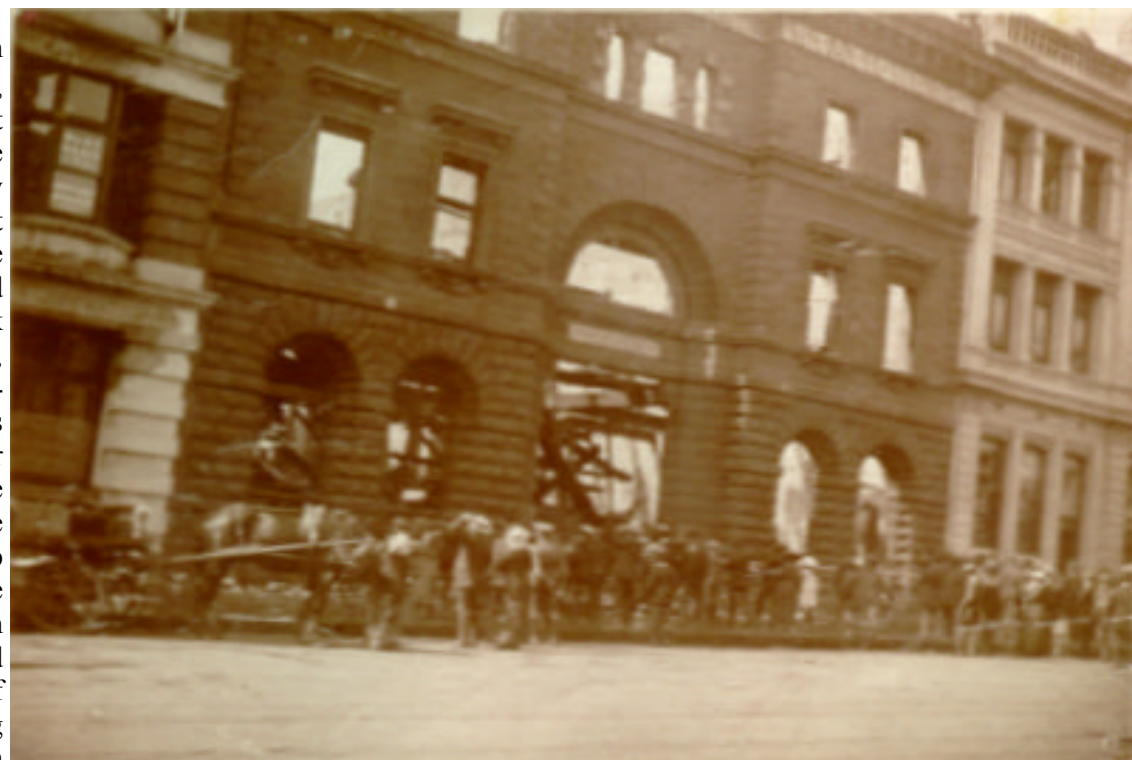
Above: This burnt-out shell is all that remained of the once grand blue-stone building occupied by the printing firm of Andrew Jack, Dyson & Co.

O n the afternoon of December 27, 1915, the greatest fire Melbourne has seen in many years, broke out in the bluestone building occupied by Andrew Jack Dyson & Co., printers, at 510 - 516 Collins Street. After gutting the premises, the fire spread to the top floors of the Aberdeen Building located on the corner of Collins and King Streets. An immense amount of damage was done and the