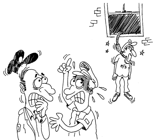
The agitated trammie was so insistent they went to have a look!!!