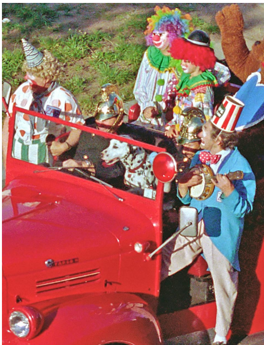
Kitt 1 riding on the Fargo No.3 Pump along with Zig & Zag and other characters, during the Christmas parade at Waverley Gardens shopping centre in 1986.