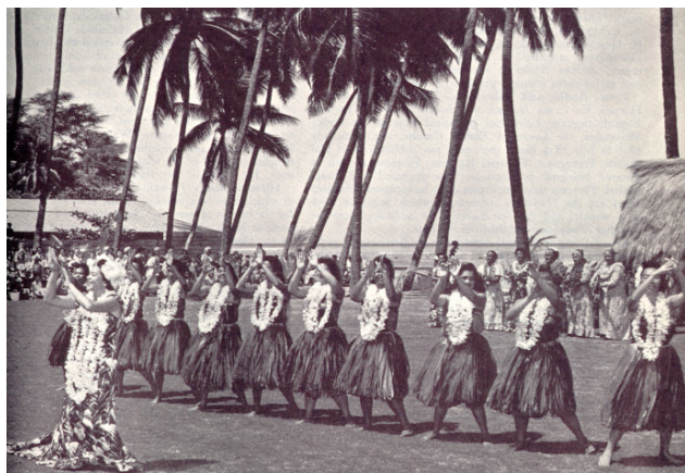
Silver picks coconuts while Mrs Silver (in front) dances the Hula to raise their fare home.

All the islands are volcanic and only on Hawaii are they still active. Hawaii is still growing as the occasional eruptions of Mauna Loa send lava flows