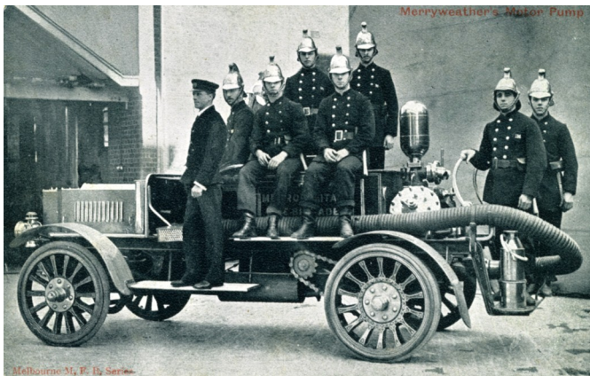
Above: An early MFB postcard of the Merryweather Hatfield pump and crew in the yard at Eastern Hill circa 1908.

In 1906 the Brigade imported two motorised appliances from England with petrol driven pumps. They were Merryweather Hatfield pumps and could deliver 450 g.p.m. The first, reg no.1417 became Car 3 and was commissioned in September 1906 and placed at FS3 Bouverie Street, Carlton. The second, reg no.1413 became Car 2 and was commissioned in December 1906 and placed at FS28 South Yarra.