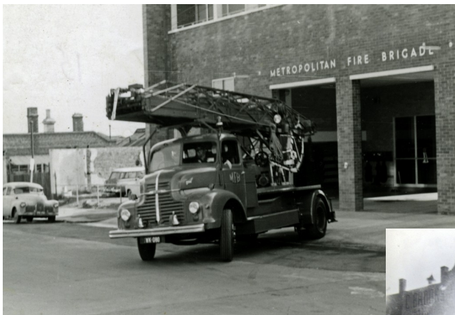
Above: The Comet Ladder turning out of FS2, Batman Street, West Melbourne in the mid 1960s.