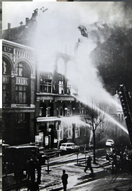
These 5 historical photos are just a sample of many that were presented for preservation on the day. There will be more days scheduled soon.