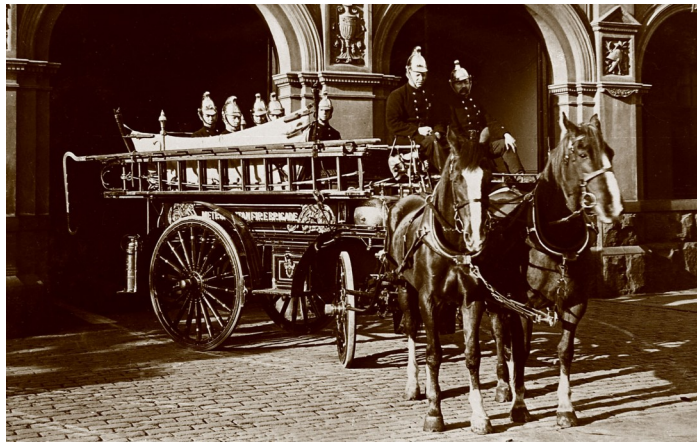
Above: A horse drawn chemical engine outside Eastern Hill. Circa 1900's.

Promotion to Officer rank (Foreman, equivalent of today's Senior Station Officer rank) was by seniority from the very beginning. Because of the small number of vacancies available for Officer rank in the M.F.B. a serving officer would have to retire or pass away before