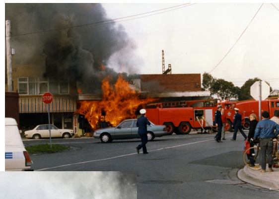
Above: The disposals store in Mentone well alight, circa 1980s.