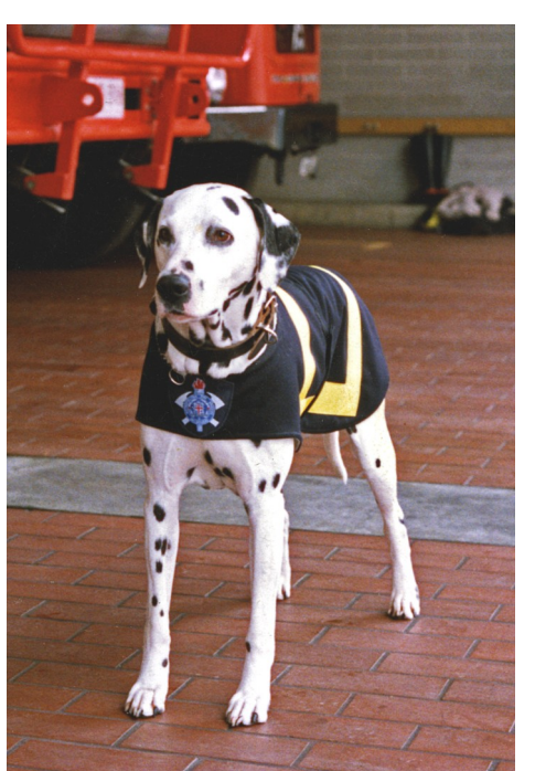
stories, and they don't go from being a fearless, but the basement would leave him a shaking wreck.

Photo right: William's Eastern Hill Fire Station.