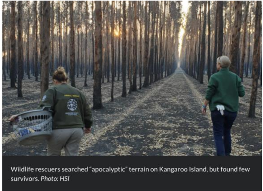
Wildlife rescuers searched "apocalyptic" terrain on Kangaroo Island, but found few survivors.

An estimated 1.25 billion animals/wildlife killed in these fires (excluding insects & invertebrates). The majority of wildlife killed including koalas, kangaroos, wallabies, wombats, echidnas, possums, birds, snakes, reptiles, etc. 50% of Kangaroo Island has been burnt. Potential extinction amongst the rarest species.