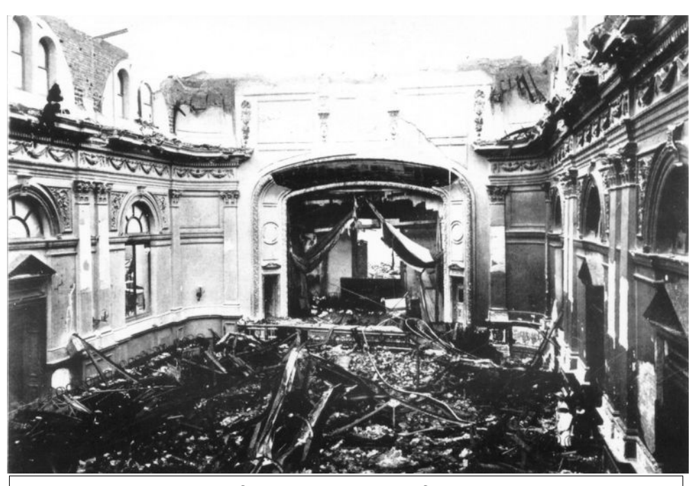
The gutted remains of the new portion of the Prahran Town Hall the "City Hall", as it was called.

Involved in the catastrophe was the new portion of the Prahran Town Hall --- the City Hall, as it was called. Its roof caught alight at the height of the conflagration and fell in, the subsequent fire gutting the interior. Conway's boot shop, a hat manufacturer, a branch store of Edments fancy goods, the town hall caretakers cottage and a cttage in Macquarie Street at the rear of the Colosseum were also destroyed when the red hot walls of the Colosseum collapsed. The Telegraph Club Hotel escaped with some damage. An early