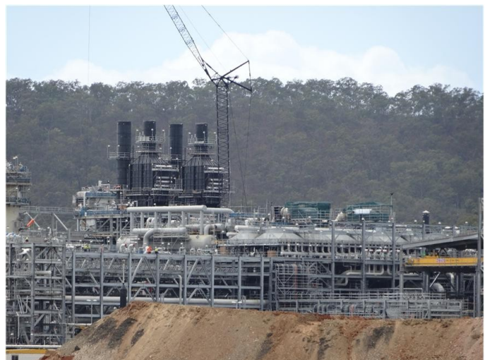
Above; One of the already installed plants on Curtis Island,