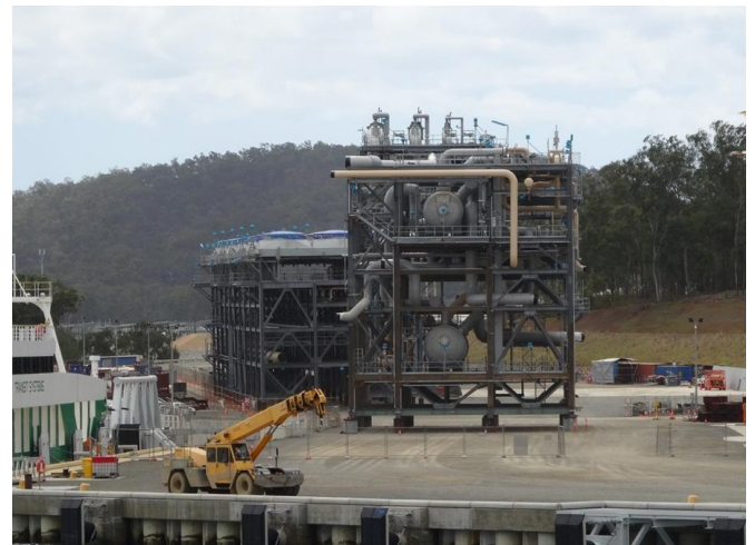
The photo above is another of the modules off the ship

The following list is from the Gladstone Area Promotion and Development Ltd list of the major industries in the area. The Gladstone Port, Queensland Alumina Ltd, Rio Tinto Alcan Yarwun, Boyne Smelters Ltd, Cement Australia Gladstone, Orica Australia, NRG Gladstone Power Station, The Gladstone Area Water Board, Queensland Energy Resources, Anglo Coal Aust Callide Mine, Peabody Energy's Baralaba Mine, Queensland Nitrates Pty Ltd, The Cracow Mining Joint Venture, CS Energy owns & operates the Callide Power Station and Sunwater Queensland's largest bulk water developer & manager.