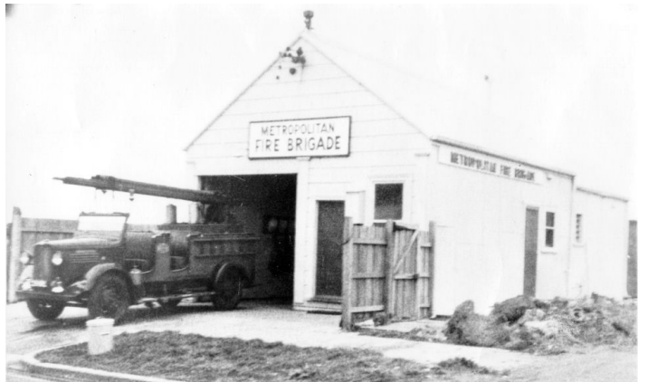
44D, (Deer park) PP Station (Circa?)

Has anyone else have stories to tell about PP