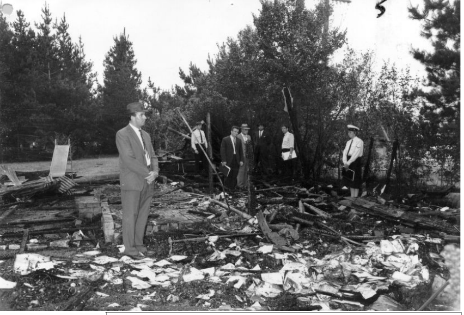
Total destruction of Nursery Police standing at location where each deceased child was found.

*the parents had no knowledge of the location where their children were taken to, all they