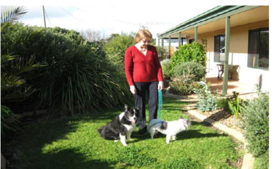
24 Roditis Drive, Ocean Grove, Victoria