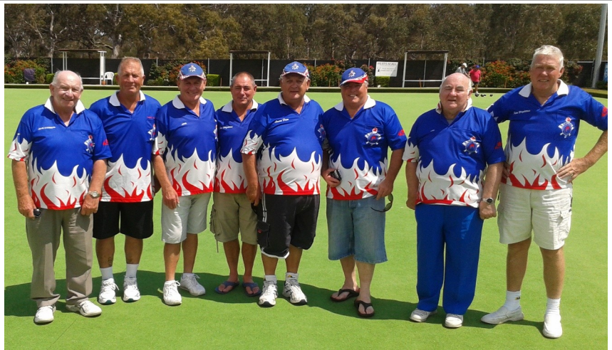
Above; The John Tate Shield Team at the Epping RSL venue. Unfortunately, unsuccessful this time.

Feb.26 versus Bacchus Marsh B.C.at the Marsh 12 30 pm start.