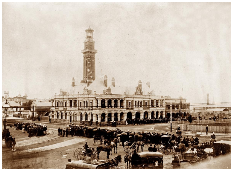
Above; The official opening of the Eastern Hill Fire Station in November 1893.

Along Gisborne Street from Victoria Parade veranda's and archways covered the entire length of the chief's private quarters to the end of the building. All of the external windows, sills and doorways on the ground floor