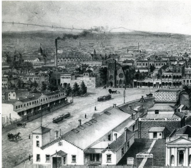
Above; View of Gisborne St and Victoria St intersection. Clearly showing the terrace houses along the left of Gisborne Street that were replaced by the Eastern Hill Fire Station..

Offices for the Officers, married and single men's quarters, toilets and wash rooms etc., there had to be a single men's dining room near the engine hall and also dormitories. At the rear of the station on the Cr. Gisborne & Albert Streets, was to be provision for a shed long and wide enough to be constructed to house the American Ladder, (the Hayes La France). Also along the Albert Street boundary there were to be stables and stalls included for housing of the Chief Officers horse and buggy, and for the horses to pull the American Ladder, including a blacksmith's shop, carpenters and painters shop, additional feed store and hay loft .