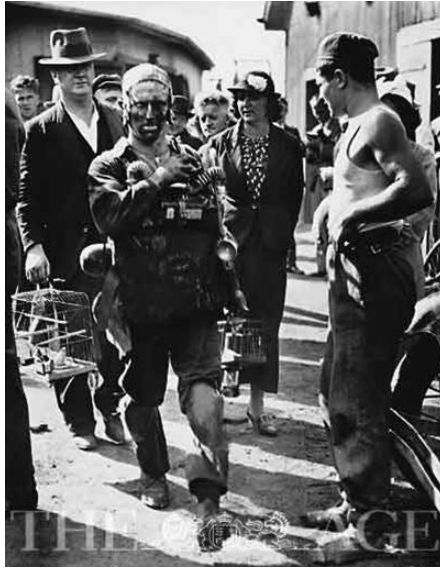
Above; Rescuer prepares to enter the Wonthaggi mine with latest canary gas analyser in the cage.

You are the expert they expect to make everything right and at this stage you would probably not had any food to eat and I reckon there is little hope of a good night's rest.