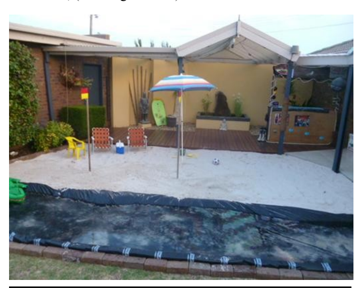
Above: The house and yard was turned into a beach with make believe sea water, sea gulls, sand, beach huts and other paraphernalia including a beachside bar.

Barry's family not only made it a party night but also a successful fund raiser for the Royal Flying Doctor Service, raising in excess of $500, plus other direct donations, (what a great idea).