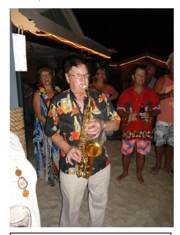
Above: Our Vice President, always willing to provide some music and help out with a charity fund raiser!

sour. Not to be outdone for the rest of the night he was dressed and had his Sax making the night a real hoot. (picture below).