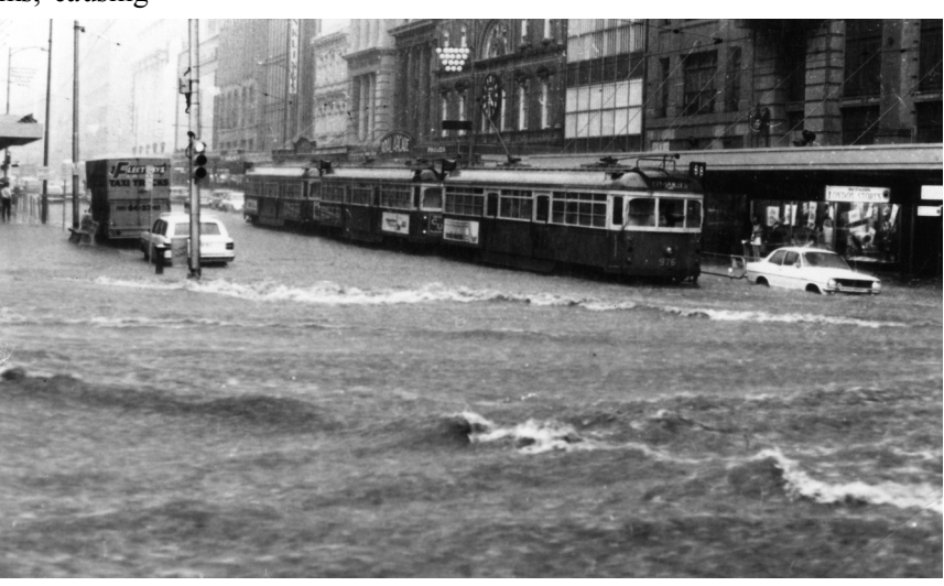
Above: The intersection of Bourke and Elizabeth Streets looking East. Flood waters rush down Elizabeth Street flooding shops, cars and knocking people off their feet.