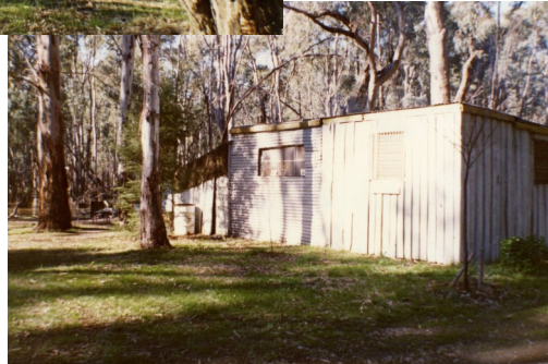
Photographs top to bottom; Station 57 site, and the “honeymoon suite”.

A couple of years later I went up to see the shack which was now double the size of the original structure and had a chimney with a one- fire stove. The new addition, added by someone else, had walls made of red gum boards. It was called the honeymoon suite.