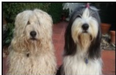
Charlie & Sage, from Mooroolbark