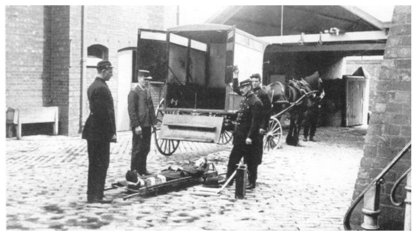
Shown - are Firemen/First Aid attendants (as they were then known) in the drill courtyard at Eastern Hill. (Note: A young Silver, always the volunteer, is strapped to the stretcher.)

With this decision one could say the wheel has just