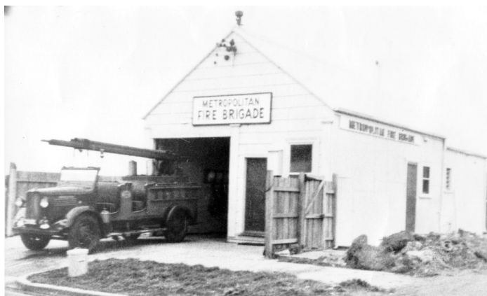
44D (Deer Park) with the Bedford Hose Carriage at front. At the time, the only hose carriage in the job that carried it's own water (350 litres).