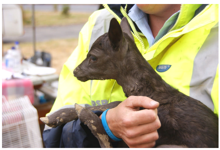
Above: Another casualty, a scorched deer, rescued from the Kinglake area. One of the fortunate few animals that survived where hundreds of thousands of bushland creatures didn't.

As this front burnt South East through Castella 13 houses were destroyed and further into the Toolangi State Forest destroying cleared farmlands, fencing etc. It followed along the North side of the Yea River, up and around the Toolangi settlement, once again Toolangi narrowly escaped annihilation, local farmers, using their bulldozers, successfully made fire lines containing the fire as it merged with the Murrindindi Mill fire, it now headed South towards Healesville.