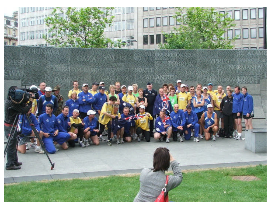
Above: The end to an epic journey, a photo shoot in front of the Australian War Memorial in Hyde Park Corner. A relief from the physical and mental stress, of overcoming all obstacles that were placed before them, and to complete their historical run to honour those who fought and died in those faraway places that team visited, and for many of us, have only read about.