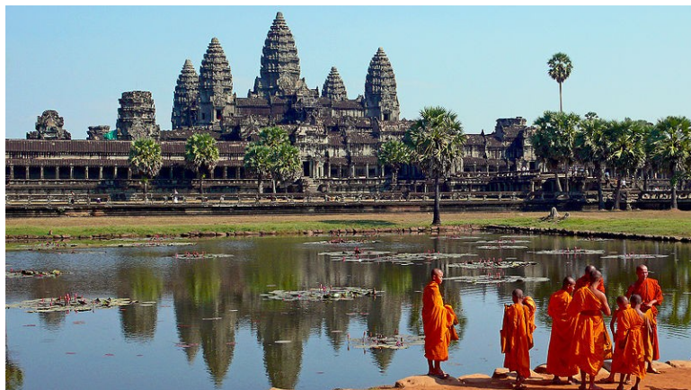
Above; Angkor Wat temple, built in the 12th century, is recognised as the largest religious building in the world.