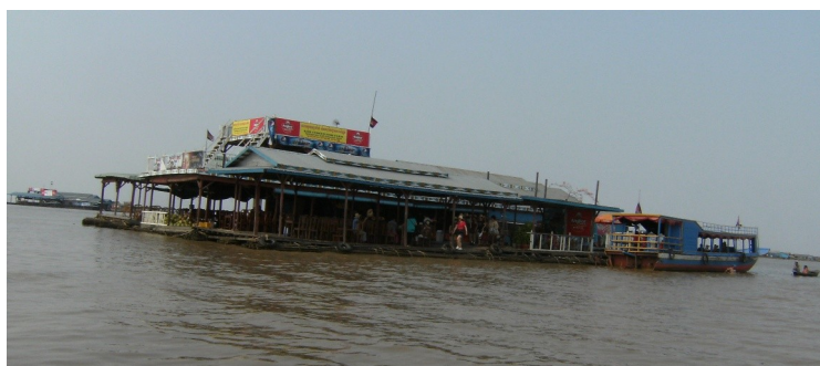
Above; Buildings of the floating village on Lake Tonle Sap