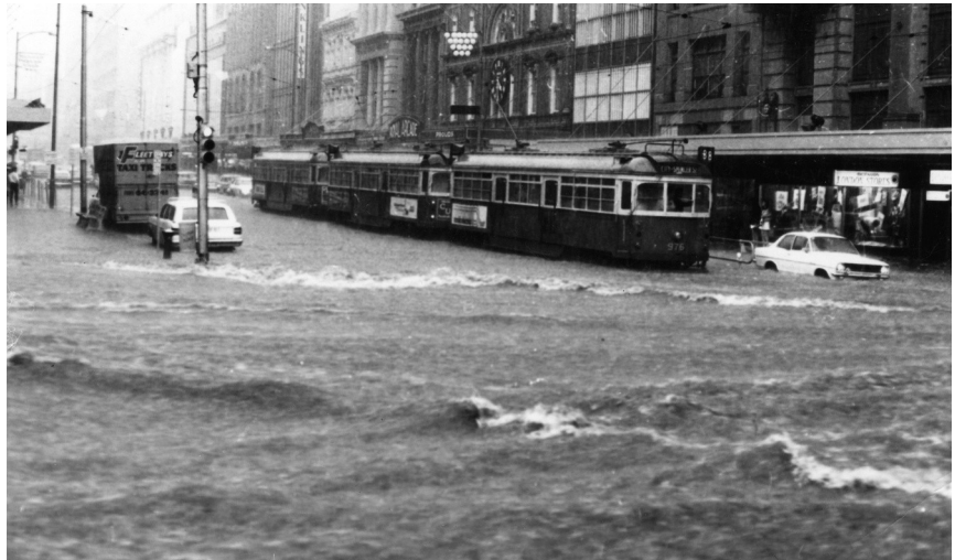
Above: The intersection of Bourke and Elizabeth Streets looking East. Flood waters rush down Elizabeth Street flooding shops, cars and knocking people off their feet.