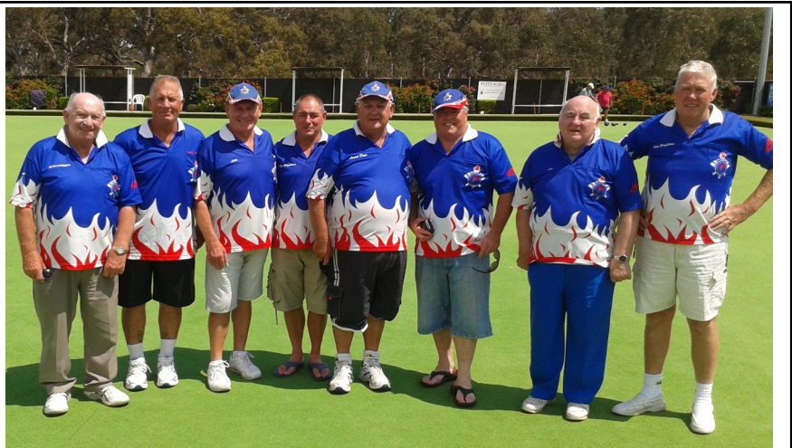
Above; The John Tate Shield Team at the Epping RSL venue. Unfortunately, unsuccessful this time.

Feb.26 versus Bacchus Marsh B.C.at the Marsh 12 30 pm start.