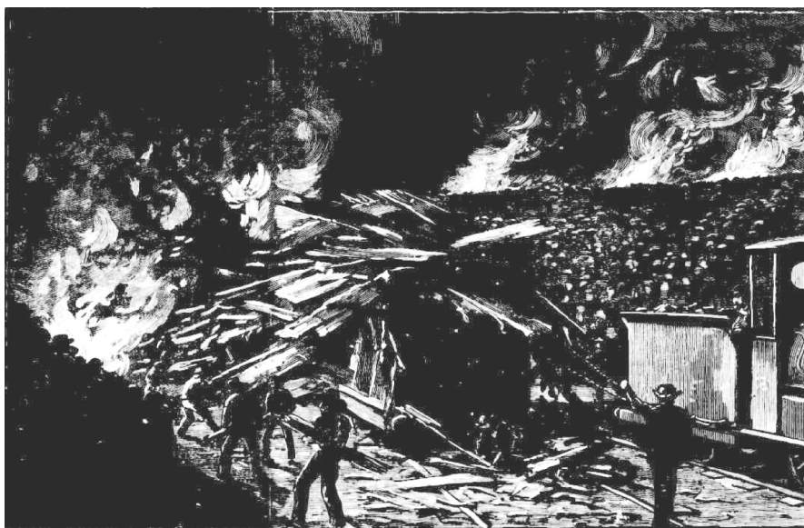
Soon the scene was lit up by a beacon fire fed by the splintered wood from the destroyed rolling stock. The flames cast a weird, red light on the pale faces of the injured.