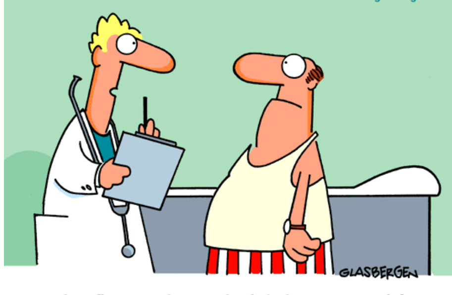
"What fits your busy schedule better, exercising one hour a day or being dead 24 hours a day?"

In our senior years, we need to ensure we eat plenty of greens, plenty of roughage, drink at least a litre of water per day and of course a balanced diet in regard to vegetables and meat.