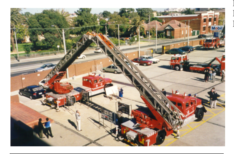
Above: The arch formed by the two Magirus Ladders led to the building entrance, it also framed an interesting photographic display.

You couldn't have wished for a better day. The warm sun highlighting the range of new appliances on display in the upper yard of the MFESB Training College. The archway leading to the entrance of the main building formed by the two Magirus Ladders set up by the Fire Services Museum. The 125 plus members all talking at once in the messroom. The smell of food slowly cooking on the spit roast wafting through the whole complex. This was the scene on